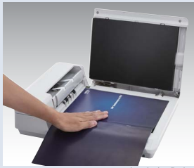
Scanned with the flatbed