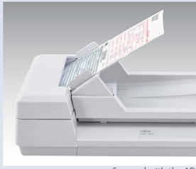
Scanned with the ADF

Combining multiple software to work together with your business system allows you to use these solutions with ease thus improving and making your business more efficient.